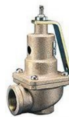
Model 537 Safety Relief

This Fort Wayne Safety Valve Works model 86E 1 1/4" Lock-up Pop Safety Valve is stamped with Kunkle's original patent date of 1875.