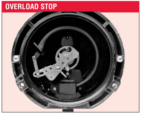
Overload Stop to protect gauge system against extreme overpressure.