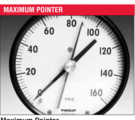
Maximum Pointer available for gauges 4½" size and larger. Indicates maximum pressure attained. Can be reset by a knob on outside of window.