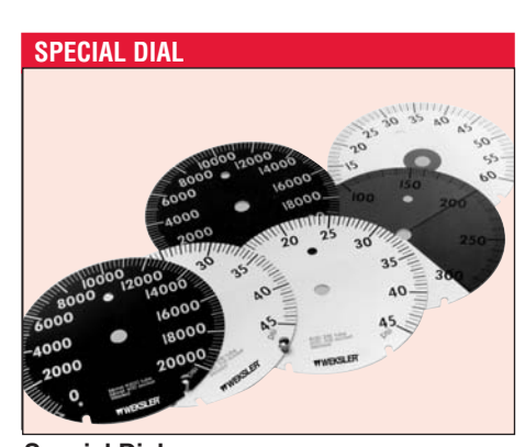
ranges different from standards, or custom artwork, available on application.