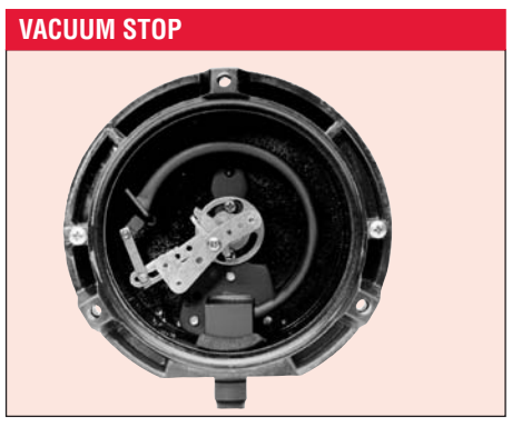
Vacuum Stop to protect low range gauges against vacuum.