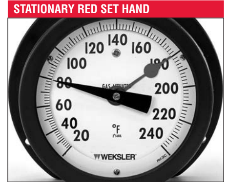
Stationary Red Set Hand to indicate a specific pressure. Ring must be removed to move the hand.