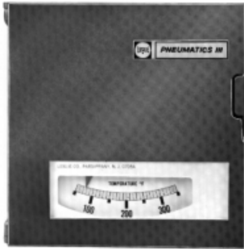
Pneumatics III Transmitter

Measurement and transmission of temperature, pressure, vacuum, absolute pressure, differential pressure, flow, liquid level and humidity.