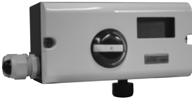
ABB TZID-C POSITIONER