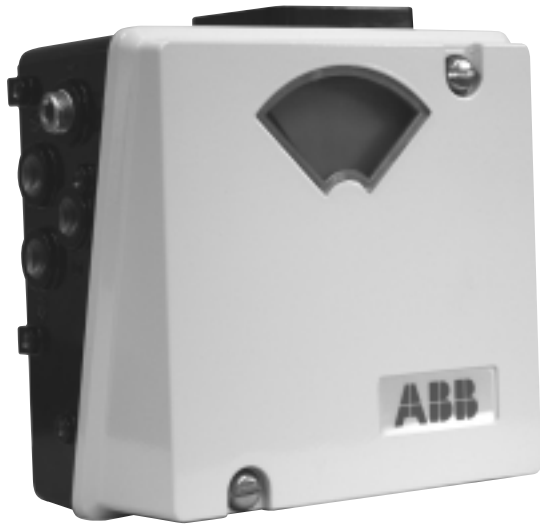
ABB AV SERIES POSITIONER