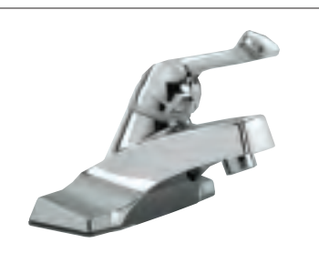
B144 - Single lever lavatory fitting, 2 hole 4" (102 mm) centers mounting, metal lever handle, 2.0 gpm (7.6 L/min) aerator