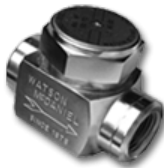
Thermodynamic Steam Traps

Steam Traps are essential components of any steam system to discharge condensate, air, or other non-condensable gases from a steam system while preventing the loss of steam. Watson McDaniel offers an extensive line of steam traps such as Thermodynamic, Thermostatic, Float & Thermostatic (F&T), and Inverted Bucket to handle any application.