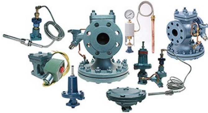
Regulators & Control Pilots

Watson McDaniel's HD Series Pilot-Operated Regulating Valves were designed for extremely accurate control of temperature and pressure in steam service applications. The HD-Series is made of Ductile Iron for extended pressure and temperature ratings. These regulators use several different control pilots which are mounted to the valve to control pressure, temperature, or a combination of both.