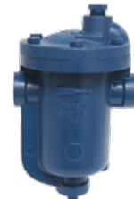
Inverted Bucket Steam Traps

M&M offers a full line of Watson McDaniel items. Call M&M Control for help with your application.