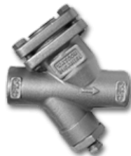
Thermostatic Steam Traps